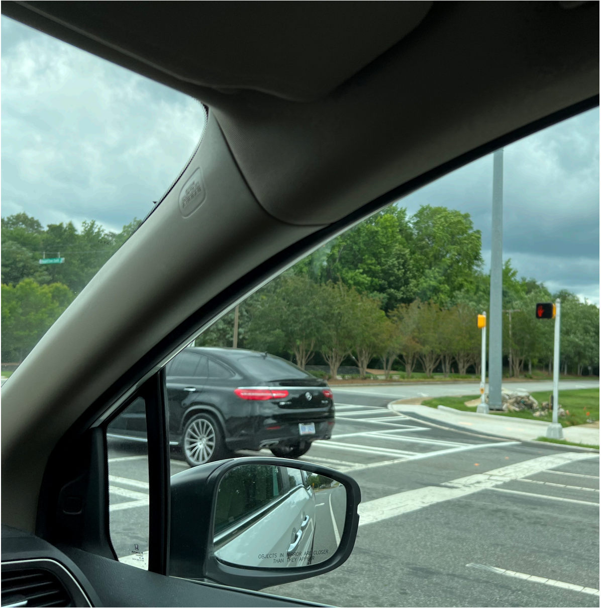
Side View(s) at Collision Site