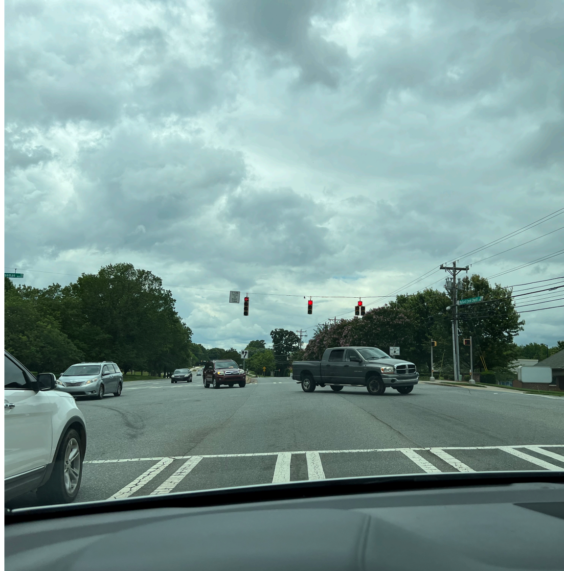
Driver View Across from Collision Site