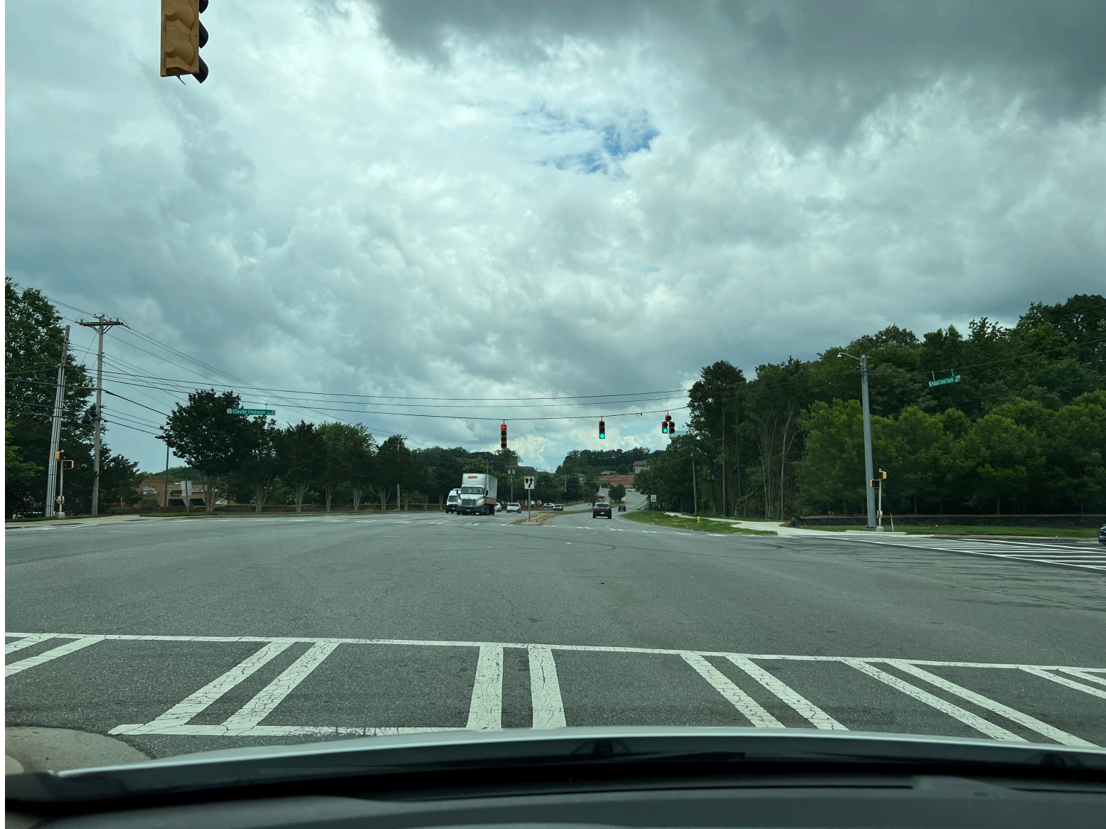
Driver View at Collision Site