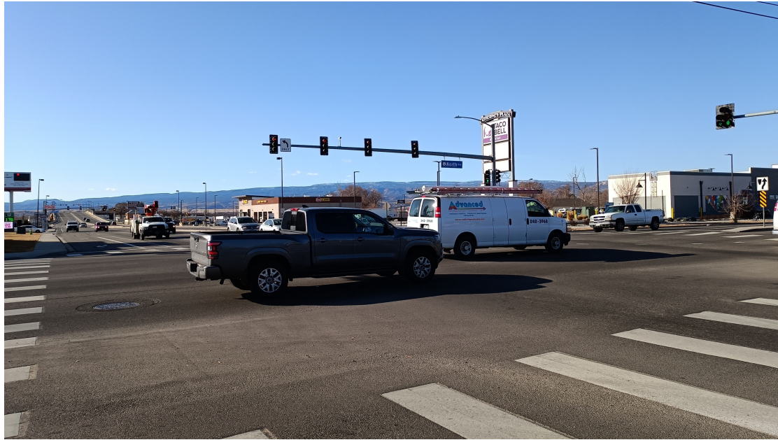
View of Intersection from NE Corner