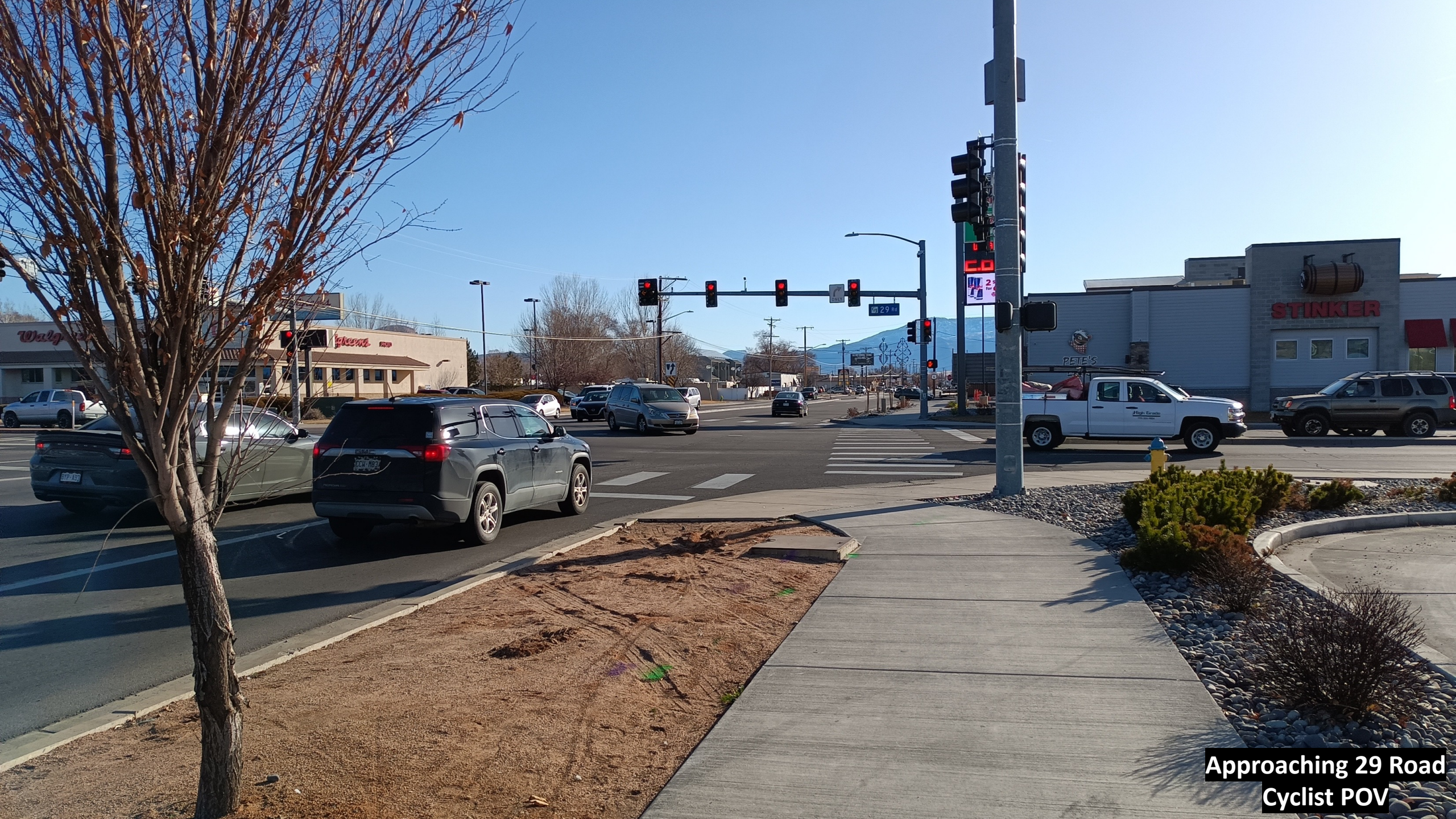
Approaching 29 Road Cyclist POV