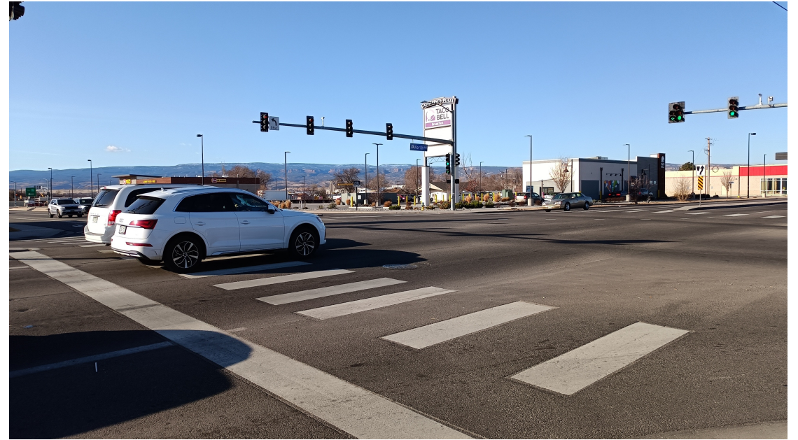
Crash Location from NE Corner