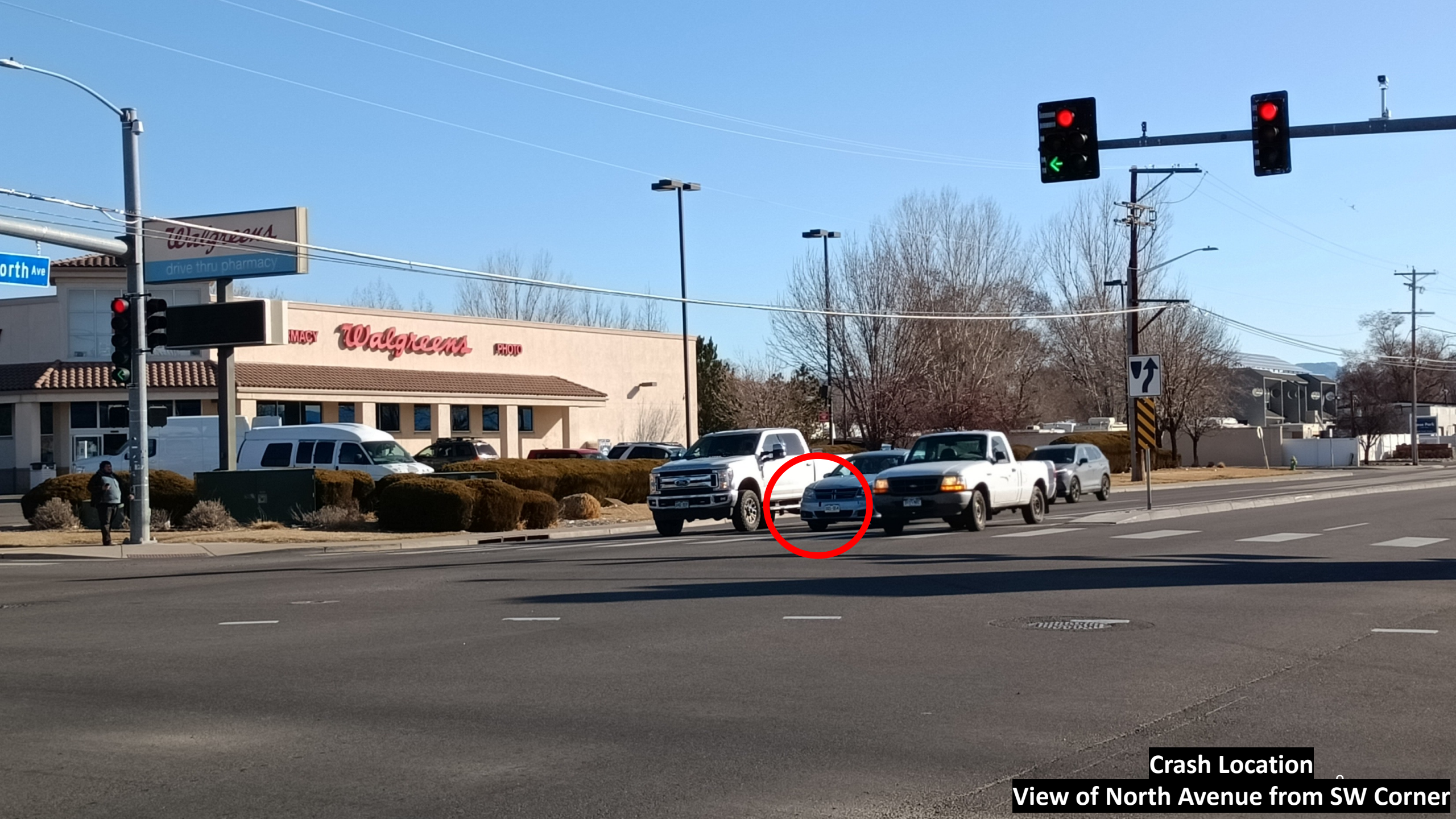
Crash Location View of North Avenue from SW Corner