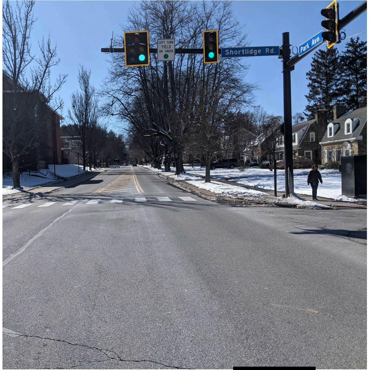
Motorist POV Approaching Westbound