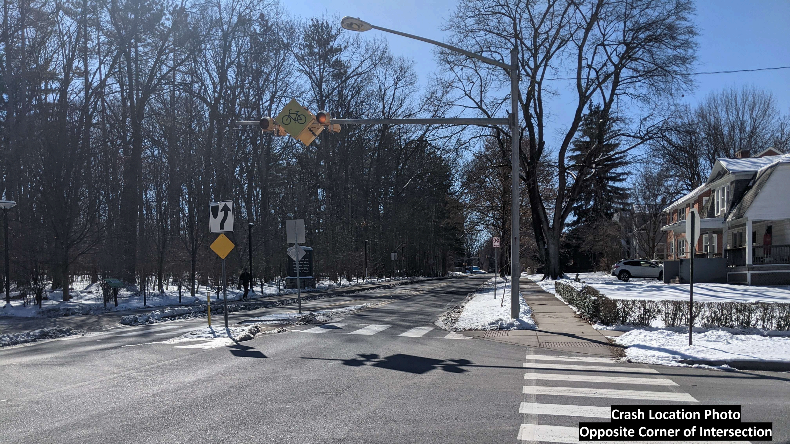
Crash Location Photo Opposite Corner of Intersection