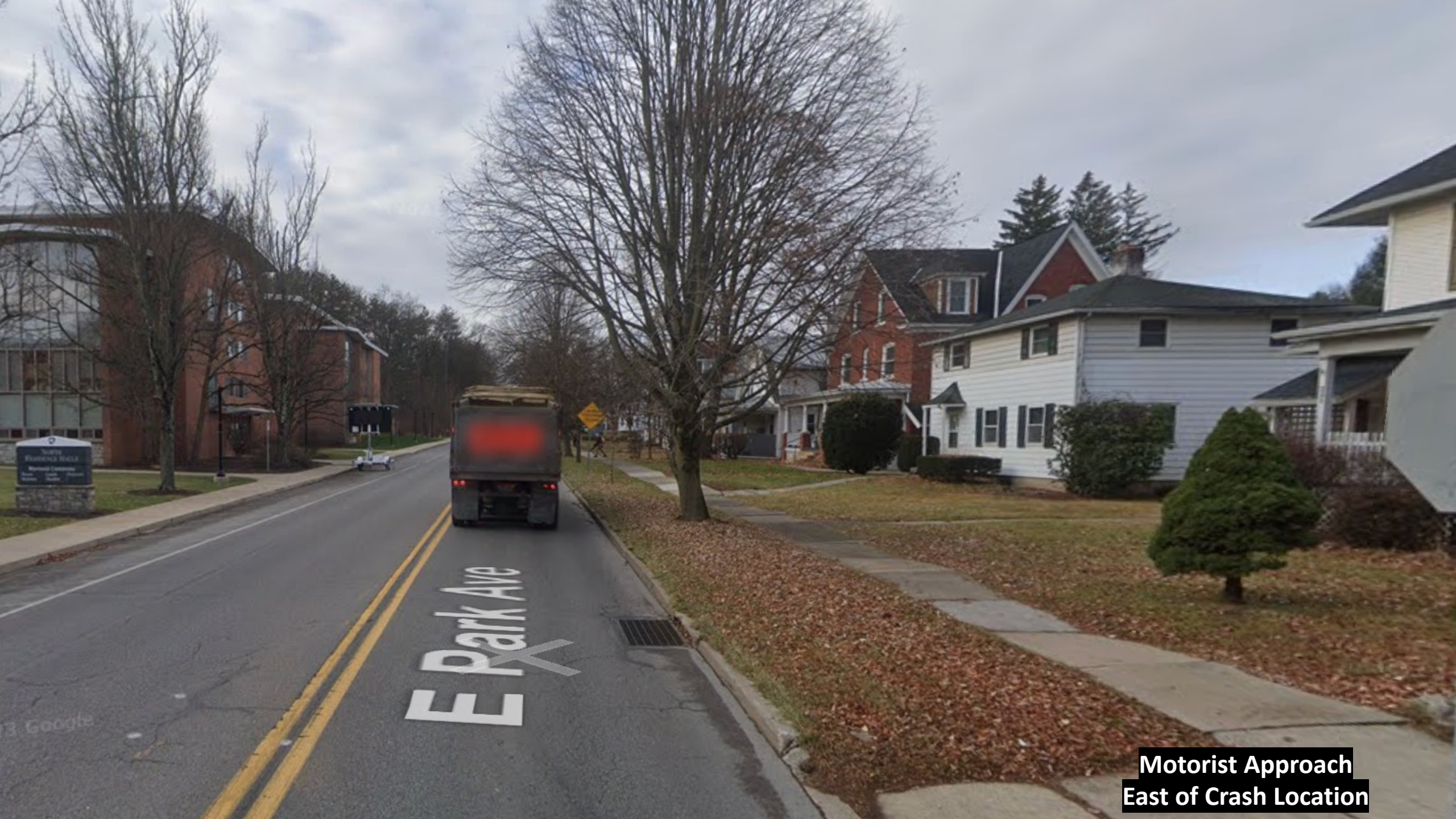
Motorist Approach East of Crash Location