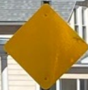
Crash Location Looking Northeast