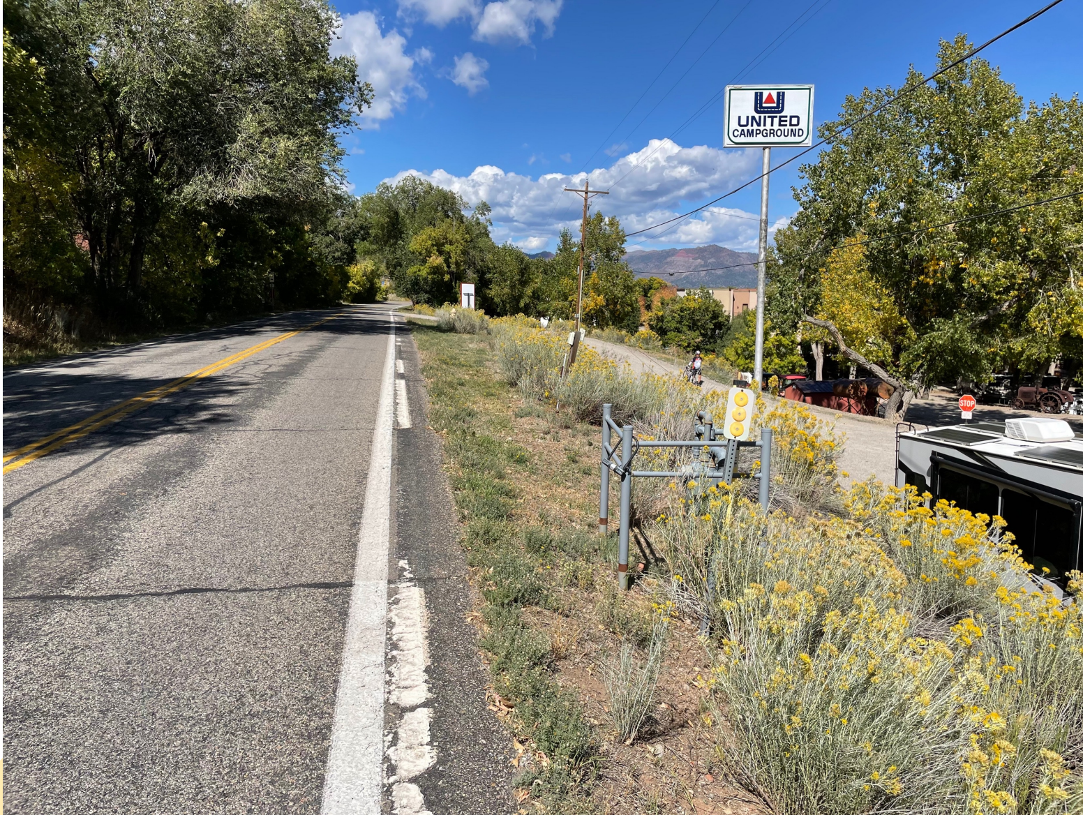
Approximate Crash Location