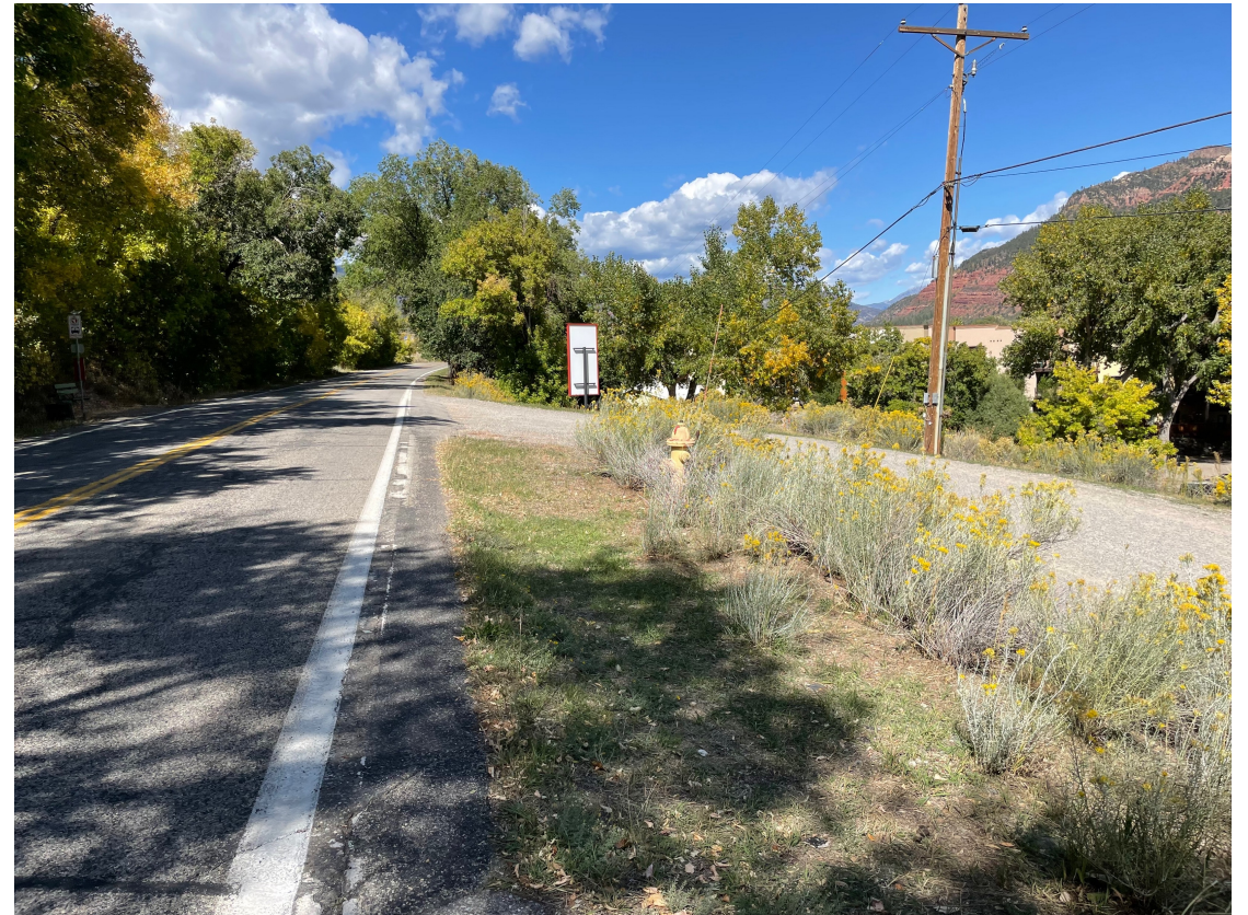
Grassy Area Just North of Collision Location