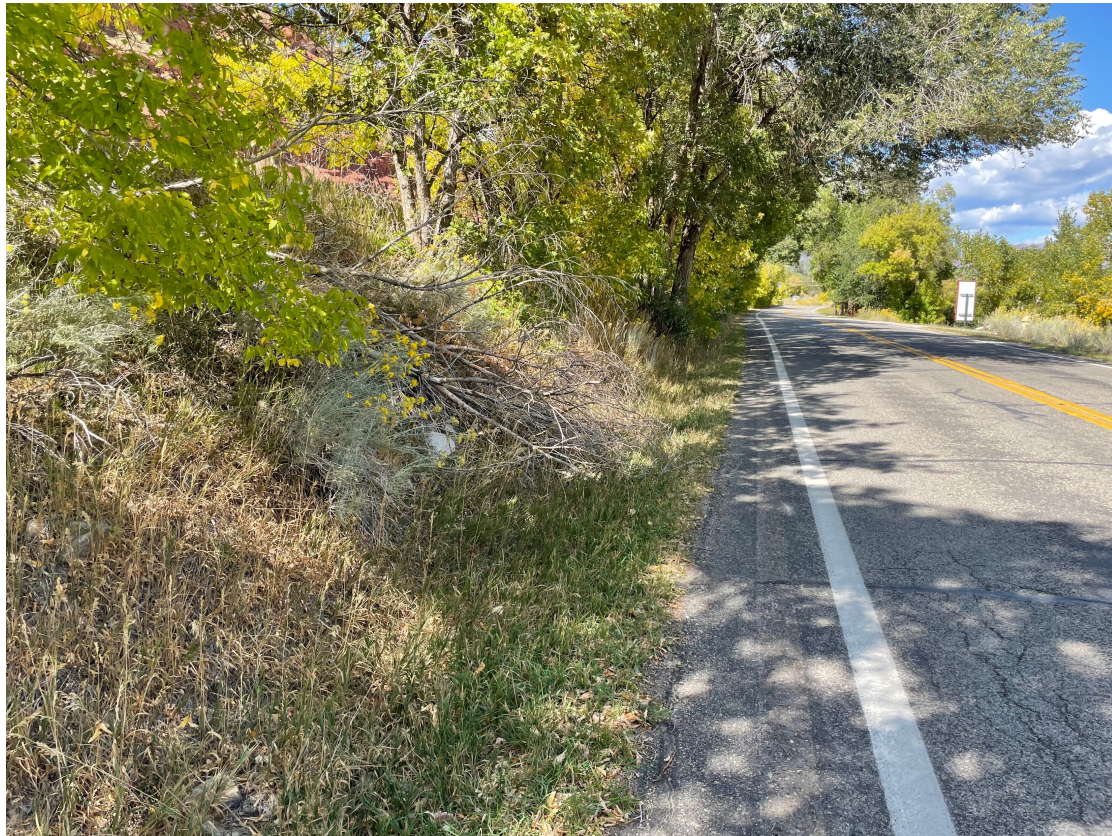
Brush alongside SB Lane Just West of Collision Location